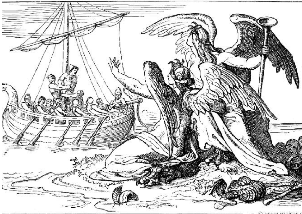
Odysseus and the Sirens